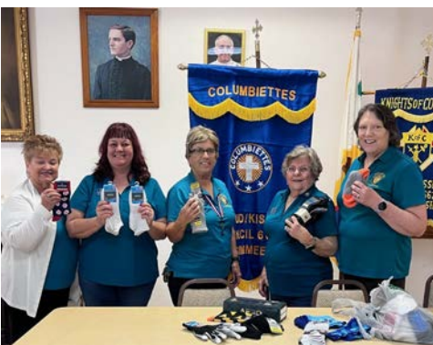
Socks and gloves for the Transition House